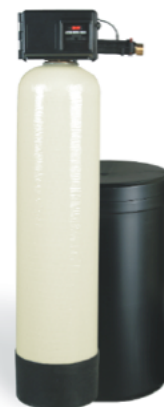
WATER SOFTENER & CARBON FILTER