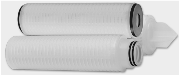
figure 1: XPleat PES filters