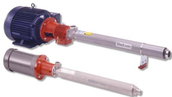
Figure 1: Tonkaflo SS Series pumps

As the industry standard for reverse osmosis (RO), Tonkaflo SS Series pumps (Figure 1) are backed by years of proven experience. The SS Series is a stainless steel multi-stage centrifugal pump with Noryl* plastic impellers. To reduce pump wear, SS Series pumps operate at lower speeds than single-stage pumps while achieving equivalent boost pressures. The SS Series' flexible, multi-stage design allows users to achieve their exact pressure requirements by adding or removing stages.