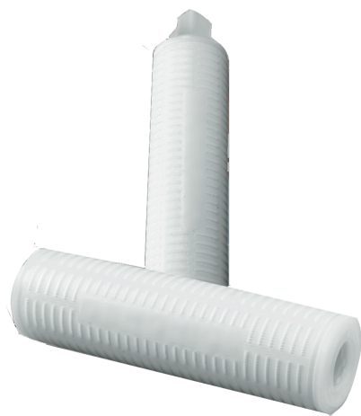
Figure 1: Memtrex KM Filters