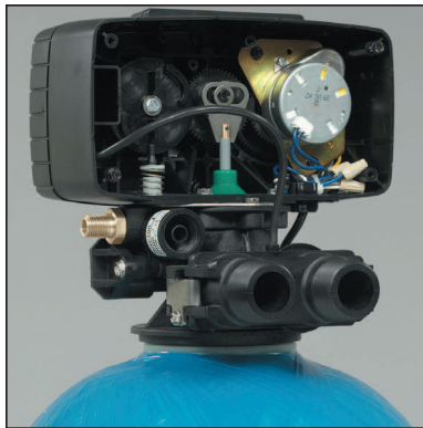
◀ Back without cover