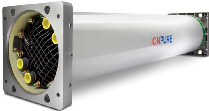
IONPURE® VNX55-EP HIGH FLOW CONTINUOUS ELECTRODEIONIZATION (CEDI) MODULES