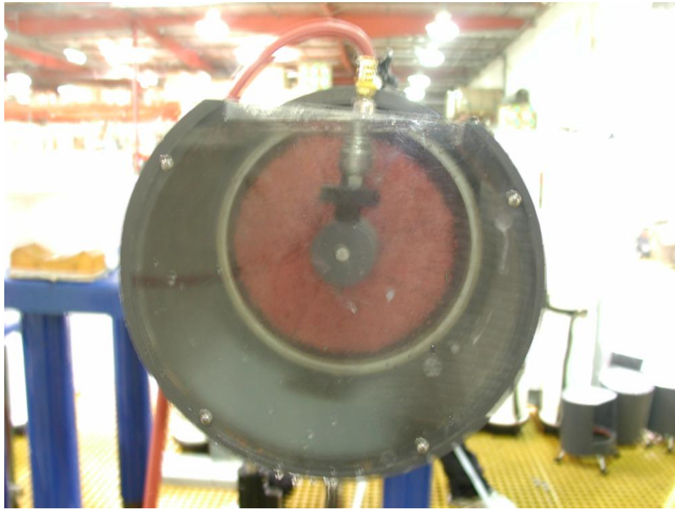
Encasement – end view