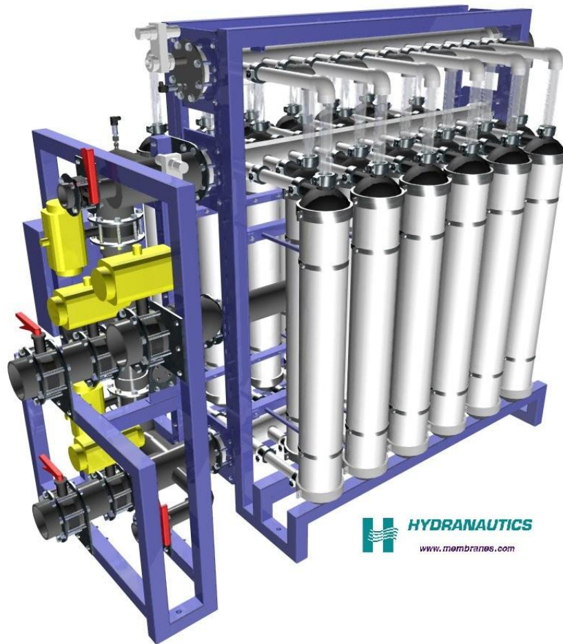
Figure 2: Sample Rack Assembly