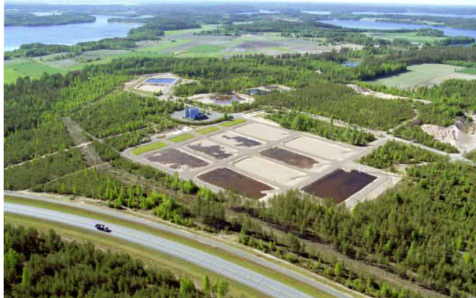
An aerial view of the Kuivala water treatment plant in southern Finland. The plant uses FILMTEC™ XLE reverse osmosis membranes to remove fluoride from drinking water.