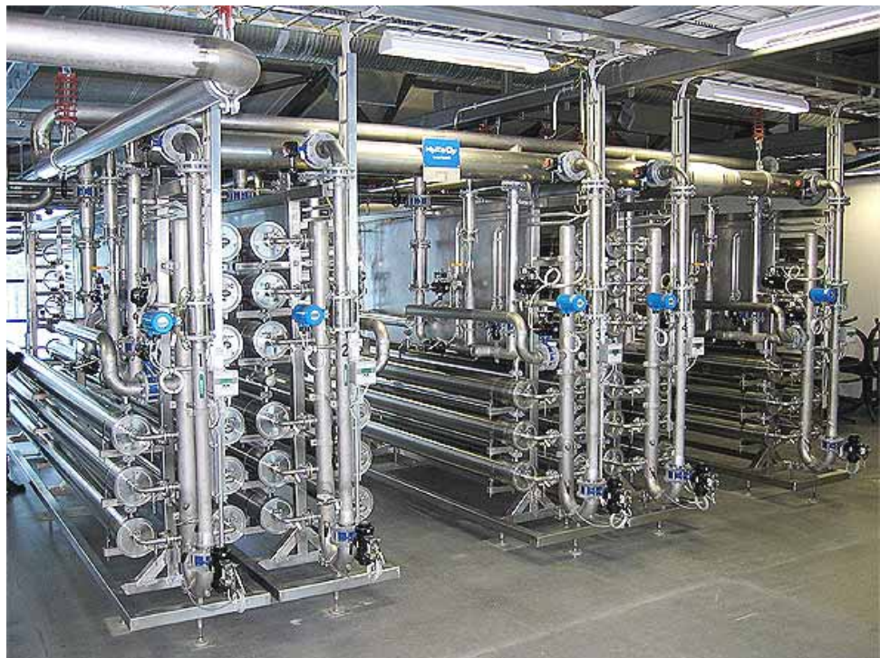
Figure 1. Kuivala RO plant