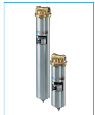
Series EKF "BE"