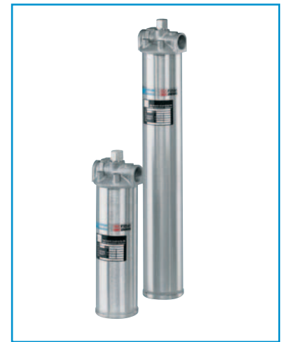
Series EKF "E"