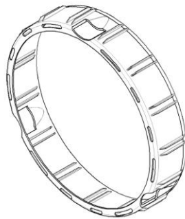
Figure 3: ZW700B-9060 Spacer Ring