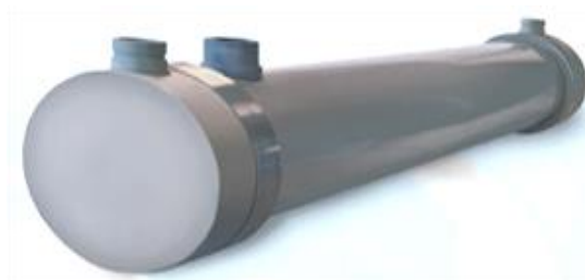
Figure 1: ZW700B-9060HT

The ZeeWeed 700B-9060HT (Figure 1) contains our SevenBore* fiber technology with an inside-out flow orientation. The SevenBore fiber is regarded as the most robust polyether sulfone (PES) product on the market.