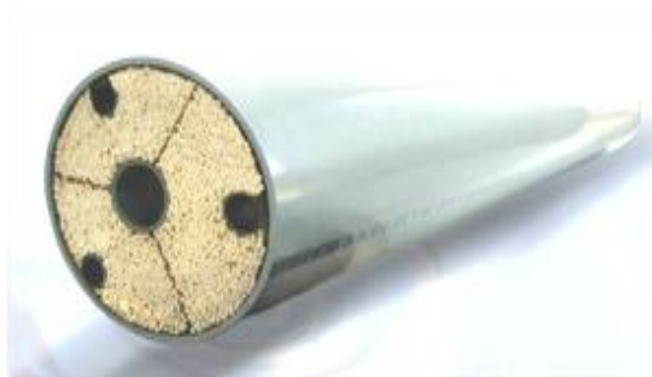
Figure 1: ZW700B-8060, horizontal

The ZeeWeed 700B-8060 (Figure 1) line of products contains our SevenBore* fiber technology with an inside-out flow orientation. The SevenBore fiber is regarded as the most robust polyethersulfone (PES) product on the market.