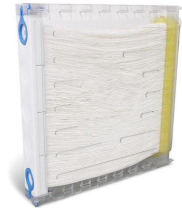
Figure 1: ZeeWeed 1000 Tertiary Treatment module