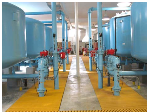
TOC Removal for DBP Control at City of Frisco, North Carolina

Treatment: Purolite offers a variety of brine regenerable anion resins that can remove organic matter (collectively known as total organic carbon or TOC). The degree of reduction depends on the specific nature of the TOC as well as the choice of resin, its porosity, contact time and resistance to irreversible fouling. As a result, our product offering includes acrylic (SBA) resins (macroporous Purolite A860 and gel type A850 ) as well as Purolite A500P , a macroporous styrenic SBA. For the more difficult to treat systems having both colloidal and dissolved TOC, we recommend our TANEX resin, a proprietary blend of resins, inclusive of a patented scavenger resin for colloidal particulate matter removal. Proper system design is important for good performance in all cases.