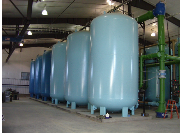
Simultaneous Removal of Arsenic, Nitrate, TOC and Uranium at City of McCook Using Brine Regenerable Resins

With use of our proprietary SST60 shell and inert core type SAC resin to remove divalent cations such as