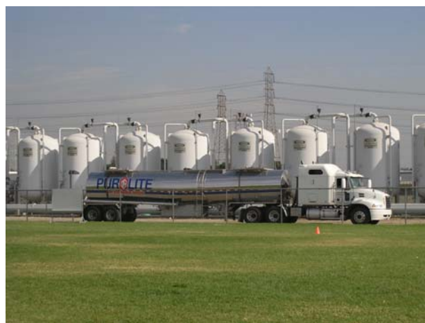
Purolite Bulk Resin Tanker Delivers Perchlorate Selective Resin to a Site in California

Services: Purolite provides a full array of services with experienced personnel for handling all resin operations to end users and OEMs.