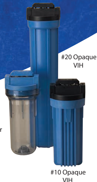
#20 Opaque VIH