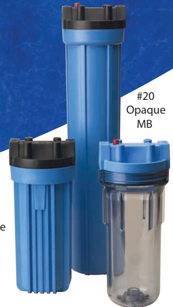
#10 Opaque MB