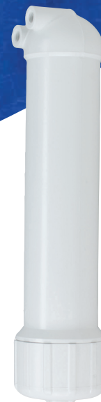
12" with 90° Outlet