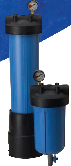
PBH-410 (Shown with bag vessel stand)*