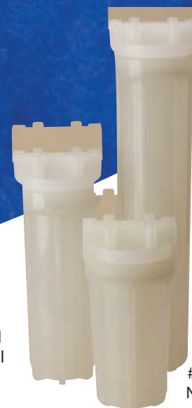
#12 All Natural