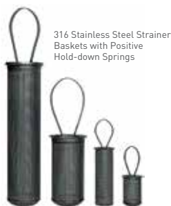
316 Stainless Steel Strainer Baskets with Positive Hold-down Springs

Standard mesh-lined strainers are backed with 9/64" perforation