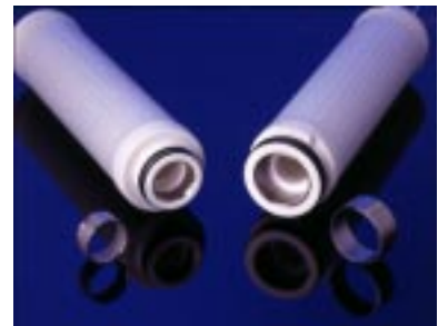
Stainless Steel Inserts

Efficiency, flow capability and service life are similar for all available constructions.