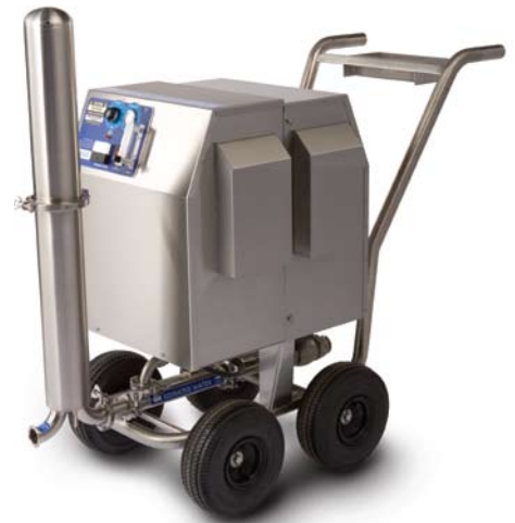
Model: PC 16 Portable Ozone Contacting System