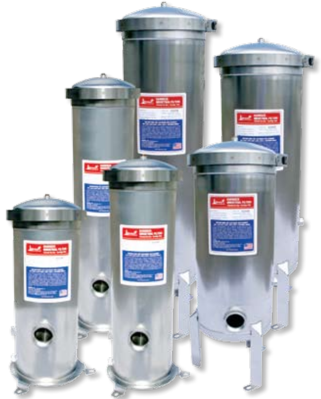
Models BC4-1, BC4-2, BC4-3, BC6-1, BC6-2, BC6-3