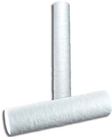
Figure 1 : Purtrex Depth Cartridge Filters