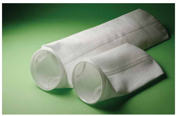
The UNIBAG filter is available in two sizes, two media material and two ring material options.