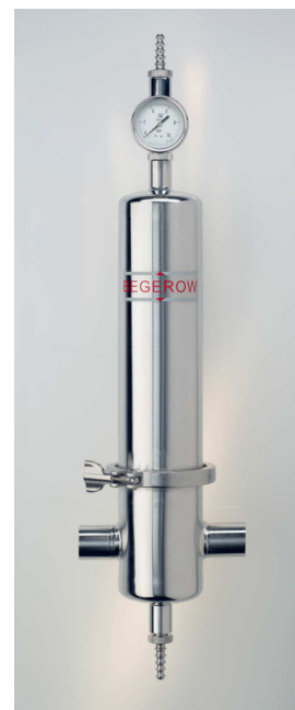
KL0-housing with G ½" connections