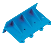
wall bracket Mignon Duplex