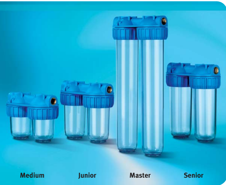
Medium Junior Master Senior