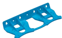
-D- wall bracket